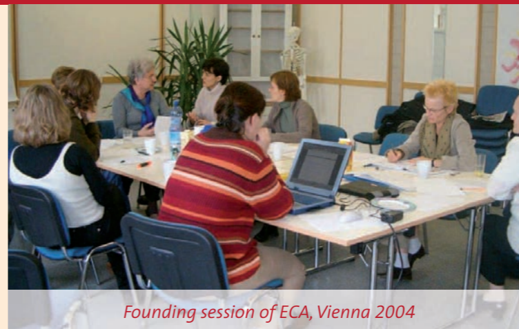
Founding session of ECA, Vienna 2004