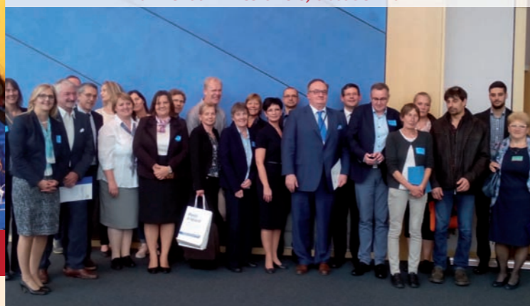
Hospitation of EVHN Nürnberg students, Munich 2018