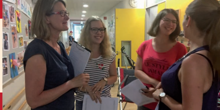
German conductor students hospitation at Phoenix Schulen und Kitas GmbH, Germany

At the same time it must also become common knowledge that CE can serve as a pedagogical concept with focus on movement, sports and music for the education of any child, disabled or not, from toddlers age onwards up to adolescence.